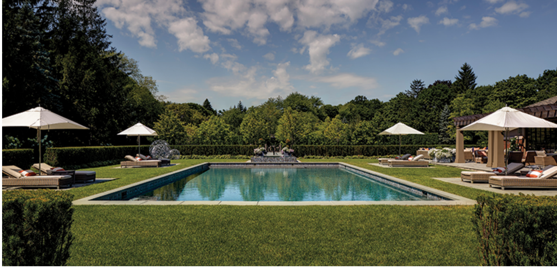
CLASSIC BEAUTY Whether it's day or night, the grounds are head-turning.

GREAT ROOM Doors – Optimum Flooring – Honed Bluestone Flooring Lighting – Flatiron, Restoration Hardware Lighting, Ceiling – Cosy Pendant, Urban Electric, South Carolina Lounge Chairs – Dublin, Holly Hunt Ottoman – Custom Tufted, Cast Bronze, Baker, Michigan Design Center, Troy Rugs – Stark Carpet, Troy Sofas – Villa By Holly Hunt, Upholstered In Great Outdoors In New Linen, Holly Hunt Wall Paint – Benjamin Moore, Revere Pewter HC-172