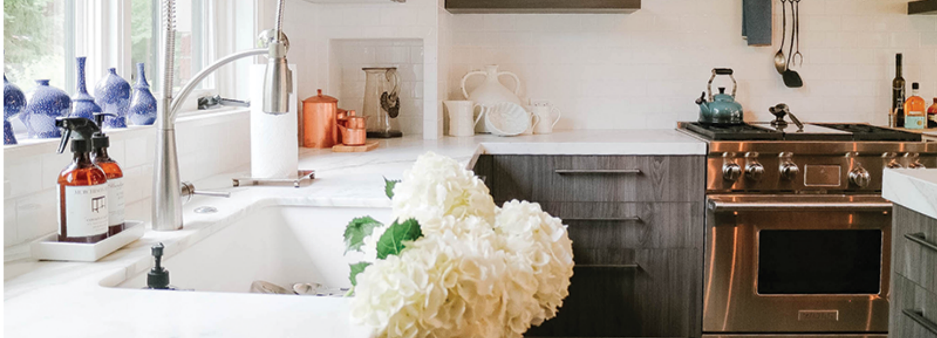
COOKING UP STYLE Durable and functional materials create a comfortable atmosphere in the kitchen spaces.

“Our concept was to create a pool house that was cool and comfortable,” David DeMuth says. The couple says they were particularly influenced by NFL player Tom Brady’s California residence, which they had seen in a magazine. “That was our foundation and our guide, and we took a lot of cues from it — including the accordion glass doors that open up the whole room, the reclaimed wooden beams (a central design accent), the vaulted ceiling, and the honed bluestone floor.” (Adds Witmer, regarding the flooring: “When you hone bluestone, it gives it a more pristine and more sophisticated look.”)