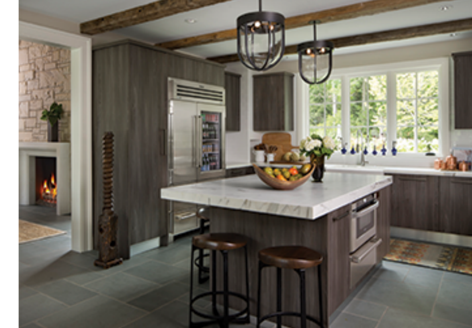
COOKING UP STYLE Durable and functional materials create a comfortable atmosphere in the kitchen spaces.

“Because the couple frequently opens up their home to the tennis community, to family, and to several charitable organizations, the materials we used needed to be durable and functional, and hold up really well,” Witmer notes.